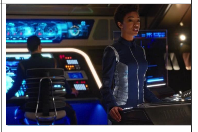
"Discovery" bridge (2023 TV version)